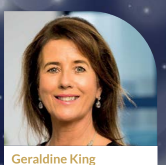
Chief Executive, Employment & Recruitment Federation