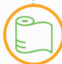
FILM OR SHEETS