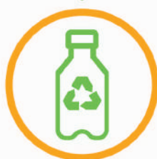
BOTTLE TO BOTTLE