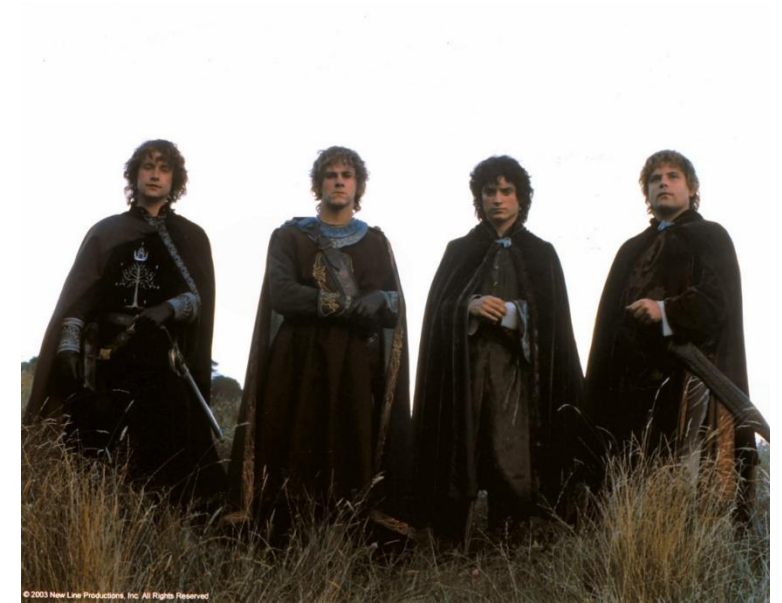
The IT Team