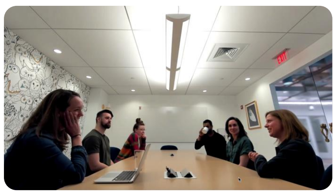
Typical front-of-room camera experience