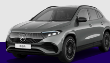
Mercedes-Benz EQA - Savings for a 40% taxpayer