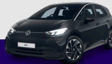
Volkswagen ID.3 - Savings for a 20% taxpayer